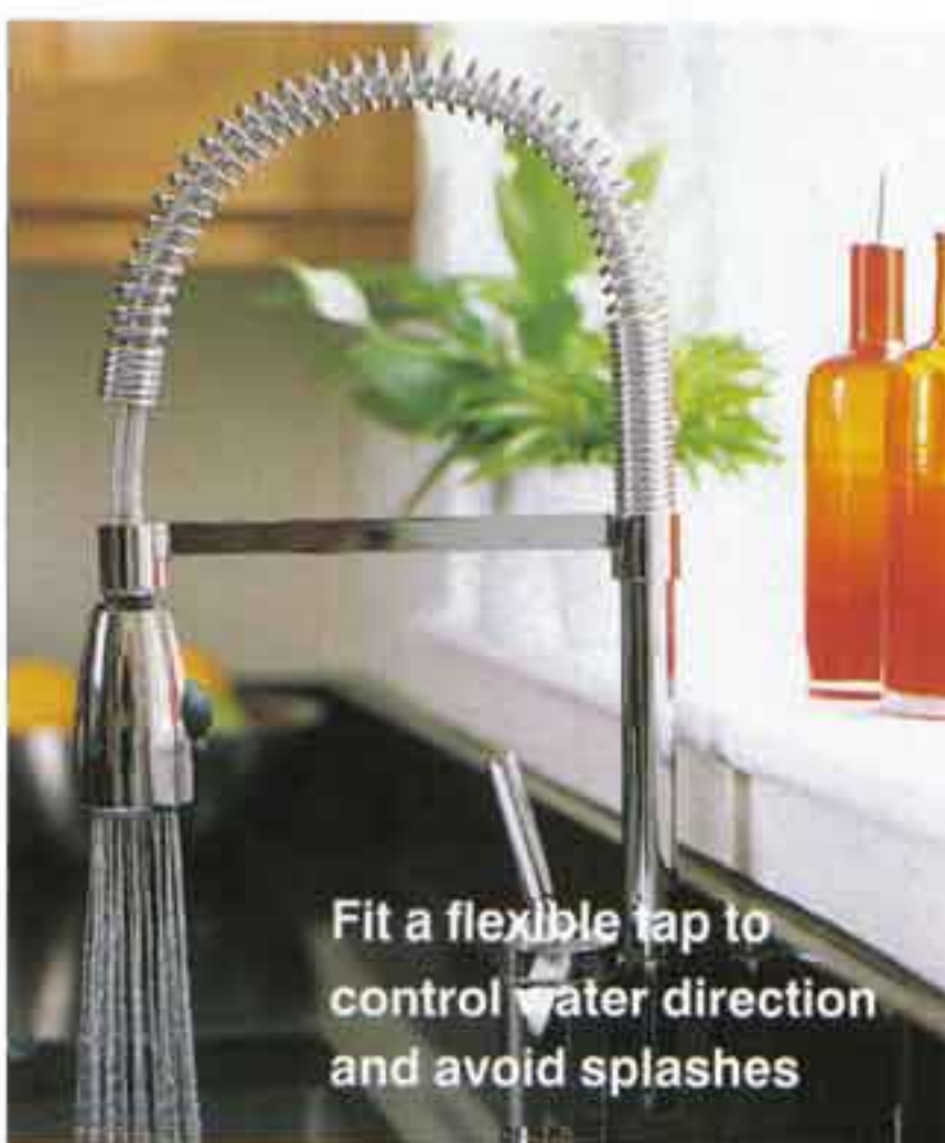
Fit a flexible tap to control water direction and avoid splashes