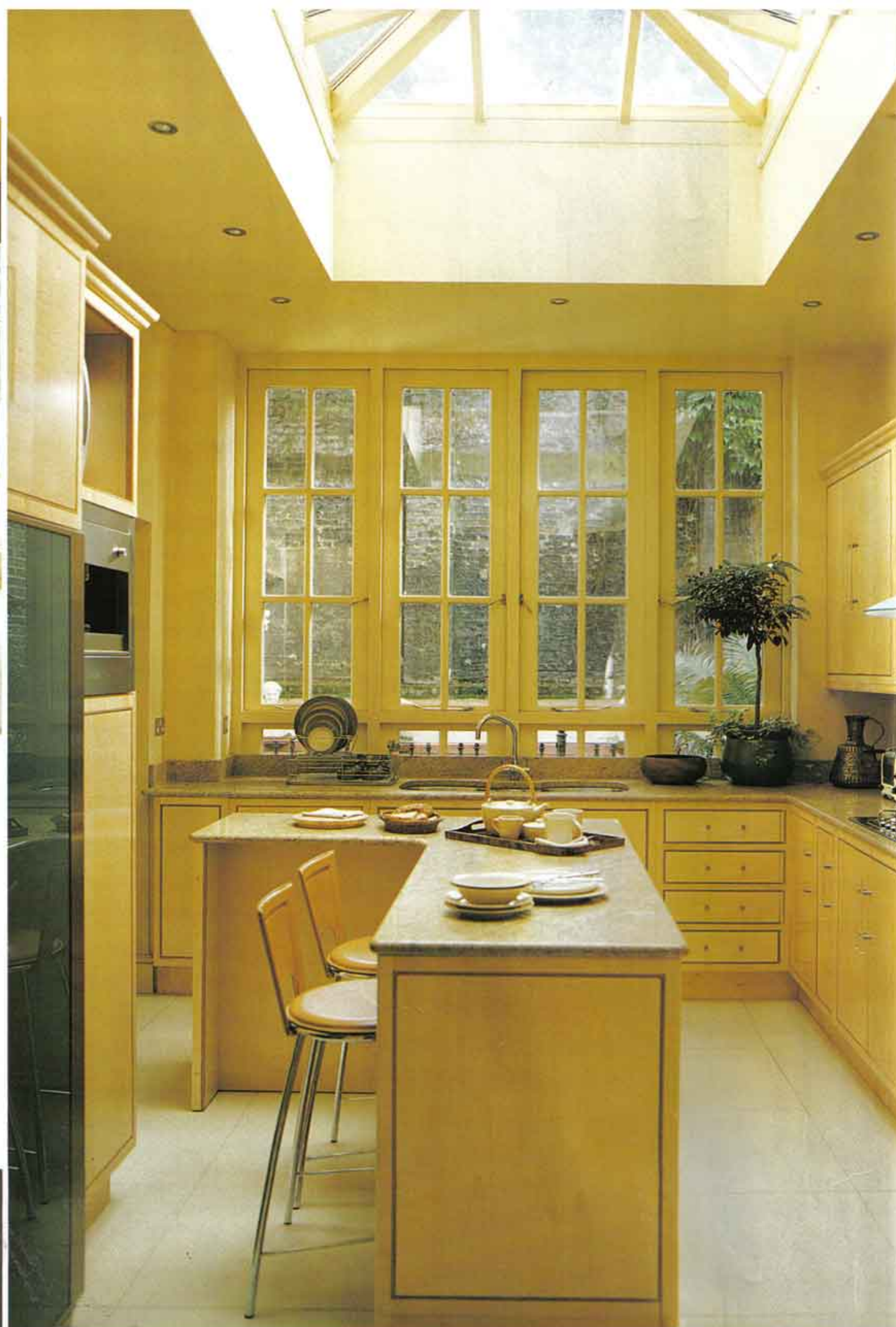
► Practical composite flooring from Classico Marble (01753-650507) was laid over underfloor heating. The couple sourced the granite splashback and worktops from Pisani (020-8568 5001)