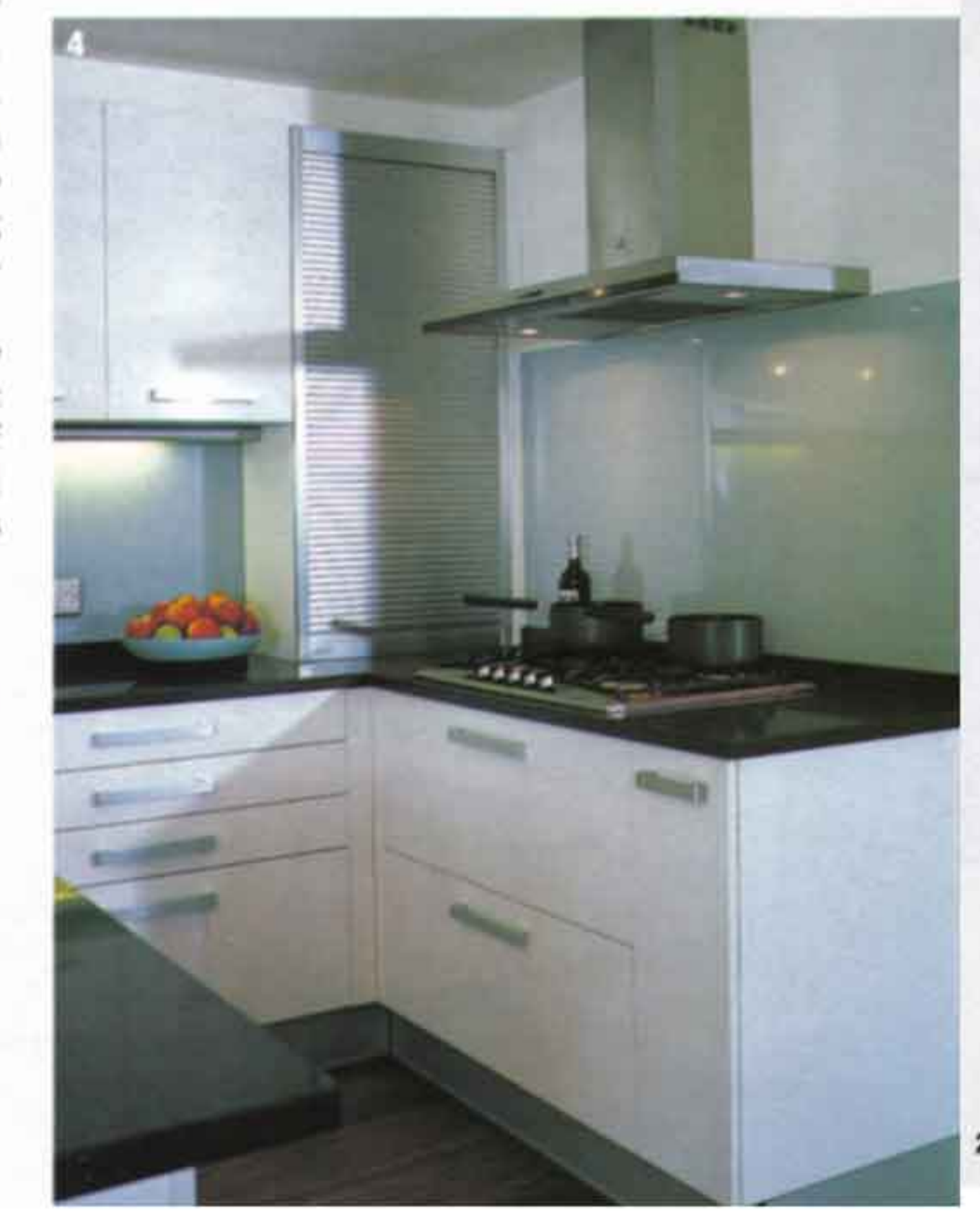
4 The style of the extractor echoes the room's angular symmetry, while a tambour-fronted cupboard provides another storage option