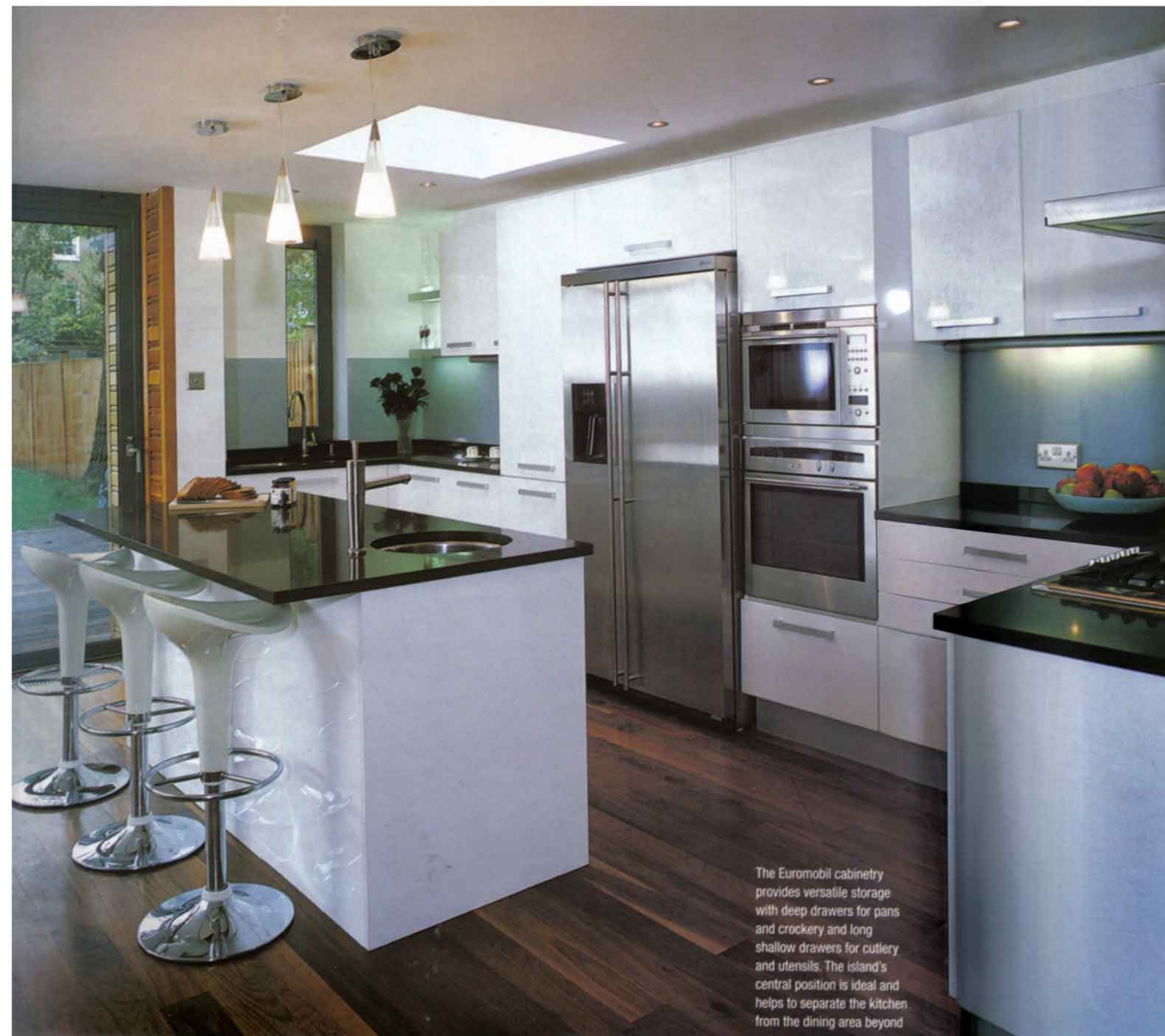
The Euromobil cabinetry provides versatile storage with deep drawers for pans and crockery and long shallow drawers for cutlery and utensils. The island's central position is ideal and helps to separate the kitchen from the dining area beyond

'Our kitchen is a wonderful space that works on every level'